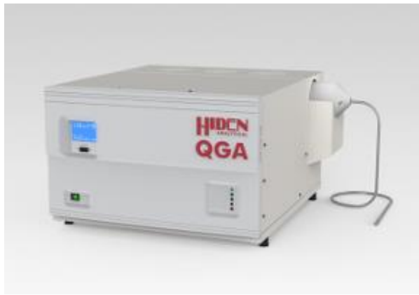
Hidden QGA quantitative gas analysis system

Detection of CO in N 2 is of importance in many application areas: